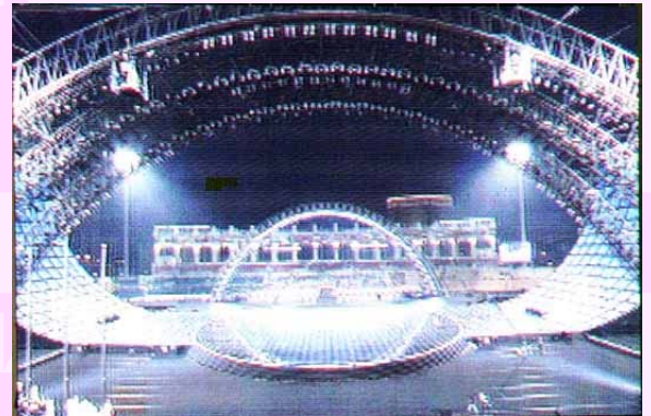
The beauty of the Macau Stadium with full Lights..

The grand opening ceremony was held in the Macau Stadium and Pavilion which boast of a capacity of more than 16000 seats. We got to the waiting area, as usual round about 3 hours earlier than required. While waiting for our march past in the Stadium, we made several new friends with our neighboring countries, exchanging our collar badges. Each of our team members tried our very best to secure the full range of collar badges from all the participating countries. Judging from the picture below, we would probably venture to guess that Melvin and Sharon were successful in their endeavors.