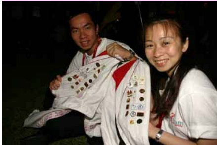
Above : M&S showcasing the various collar badges collected