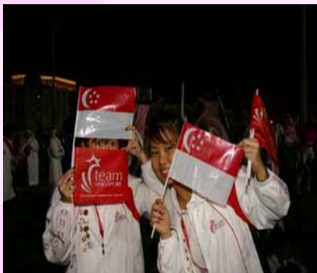
Left : Guess who's looking through the flats? (Hint : R & R)