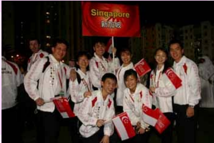
Right : DS Team in waiting area..