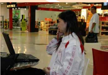
Right : Team Singapore settles down to eat a hearty meal before boarding the budget airline to Macau. (There is no food provided on the plane)