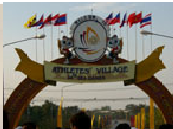
Arriving at the Athletes Village in Korat with the rest of the Singapore contingent.