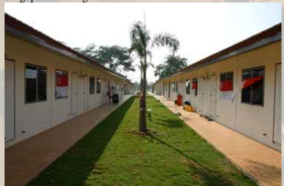
Our living Quarters