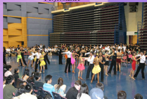
Team Match Participants in the Friendship Dance