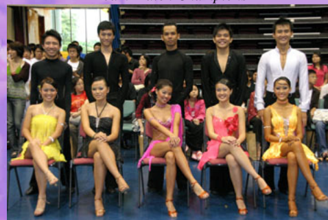
Ngee Ann Polytechnic Team Match 1 st Runners Up