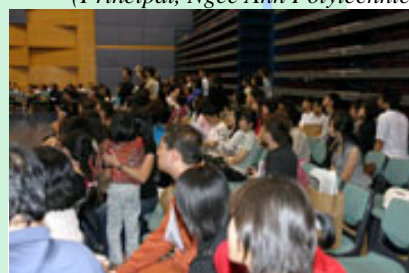
This is the largest crowd drawn since the start of the Tertiary Competitions