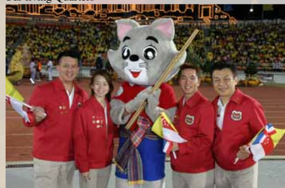
DanceSport athletes, official and coach at the Opening Ceremony parade, together with the Mascot.