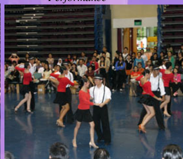
Nanyang Polytechnic in the Opening Performance