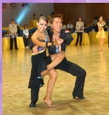
Top : Cha Cha Cha in Semi-Finals Bottom : Rumba in Semi-Finals