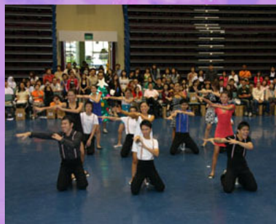
Ngee Ann Polytechnic in the Opening Performance