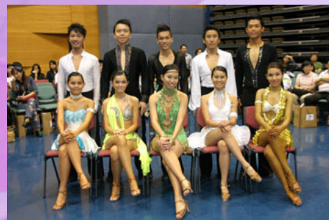
Singapore Polytechnic Team Match Champions

Last but not least, the climax of the team match is their opening dance item. Each team uses their creativity to come up with different introduction of their teams. For the 3 rd consecutive time, and by no mean feat, Singapore Polytechnic won yet again the Best Performance Award.