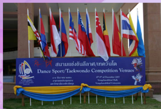
The country flags of participating Teams.

We were very happy to make it into both Finals amidst the very tough competition on the first day.