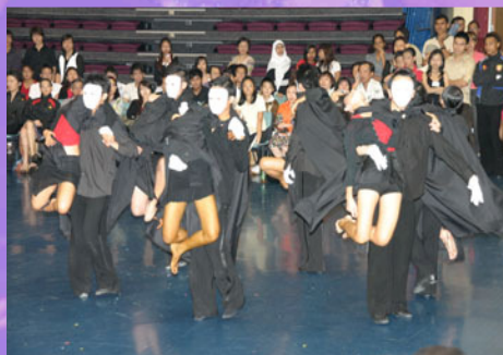
Singapore Polytechnic in the Winning Opening Performance