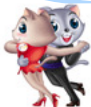
Nong Can (Siamese Cat), the 24 th Southeast Asian Games Thailand 2007 Official Mascot