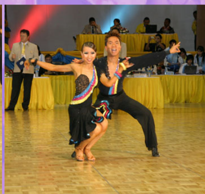
Top : Our Cha Cha Cha in the Finals Bottom : Performing our Rumba in Finals