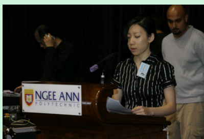
Ngee Ann Polytechnic DanceSport President giving the Opening Speech