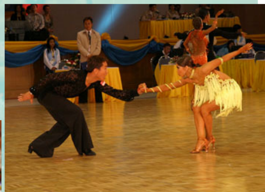
Top and Bottom : Our Jive in the Semi-Finals.

Top : The end of our Competition Bottom : Our Paso Doble in the Finals