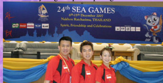
In the Competition hall – March Past