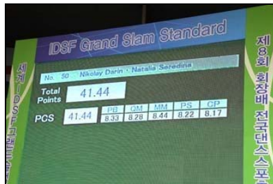
Results for the individual dancers were displayed on large screens in the venue (Seoul Olympic Park, Gymnasium 1). Dancers were judged based on several criteria.