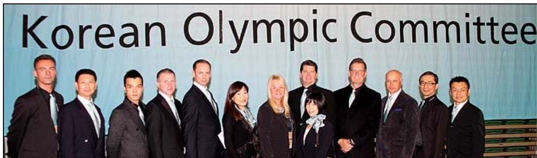
Adjudicators – IDSF Grand Slam Standard (Seoul, Korea)