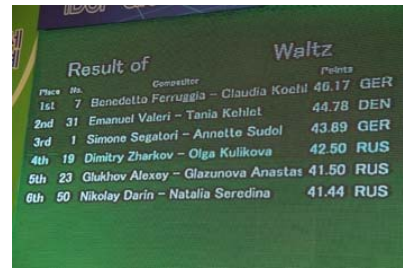
A summary of the results after the Waltz. This was acknowledged as a very transparent and efficient system by the panel of very experienced international adjudicators.