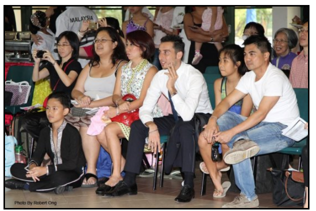
Sell-out Crowd Enjoying the Championships