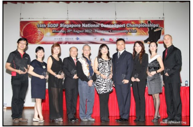
Panel of Adjudicators & Scrutineers

The team (above left) that brought you these Championships were from the SGDF and the Hougang Community Club, both working hand in hand to ensure that nothing was left to chance. To ensure sports safety was observed at all times (above right), a First Aid Kit, an Automated External Defibrillator (AED) was present. In addition all athletes were required to compete Physical Activity Readiness Questionnaire (PAR-Q).