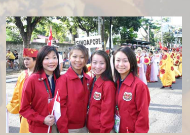
Top: The ladies in the DanceSport Team

As Cebu was one of the cities hosting 9 of the sports, we had our own opening parade. The atmosphere at the stadium and along the roads where we marched were thick with celebration.