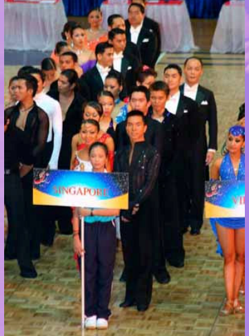
Official Opening of DanceSport Event.