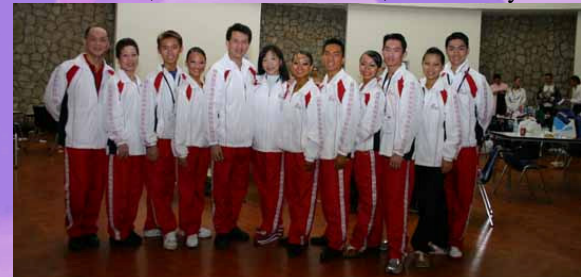
Singapore Team, in our track suits.