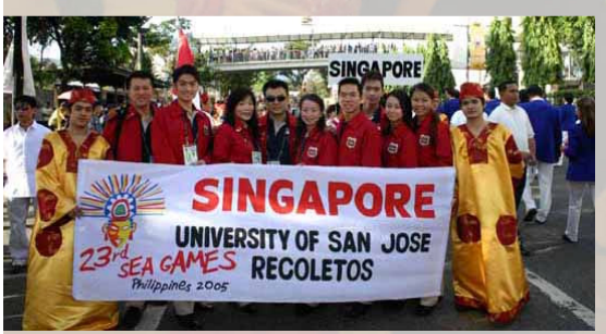
DanceSport athletes, officials and coach at the Opening Ceremony parade