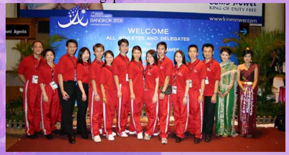
Upon arrival, we received a warm Thai Welcome.