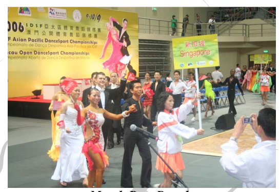
March Pass Parade