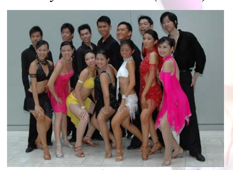
Singapore Poly DanceSport Club