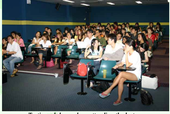
Tertiary club members attending the lecture

Topics covered include – Personal Grooming, Tanning, Hairstyles, Costumes, Accessories, Shoes, MakeUp and importantly, the extra edge a competition needs.