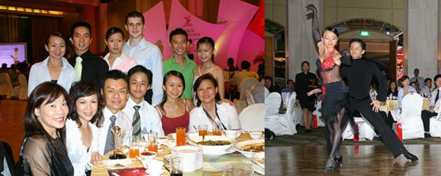
Special Invitation for the SGDF to perform at The 2006 Sports Awards Night